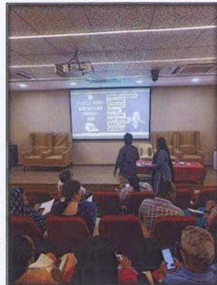
NEP Presentation for staff members